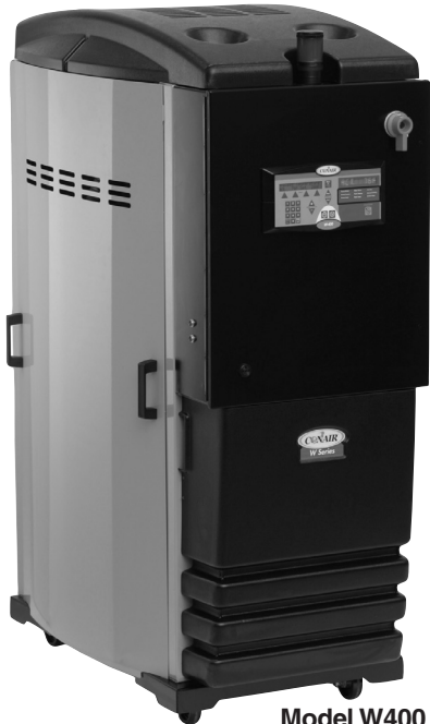
Model W400 shown with DC-2 controls and the audible and visual alarm package