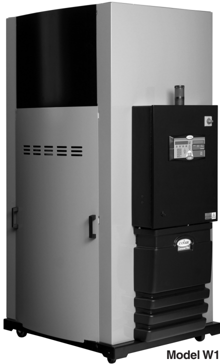
Model W1000 shown with DC-2 controls and the audible and visual alarm package