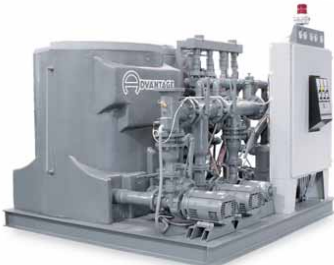
Titan® Series central chiller, Model TI-40W shown with integral 450 gallon pump tank and optional standby pump.