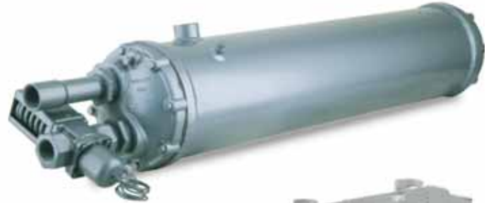
Manifold for water-cooled condensers. Manifolds include isolation valves.

Water-cooled units use tube and shell condensers with removable heads for cleaning. The condenser is equipped with a water regulator valve that maintains stable refrigerant pressures under a wide range of condensing water temperatures and pressures. Water-cooled condensers are manifolded to provide a single process connection.