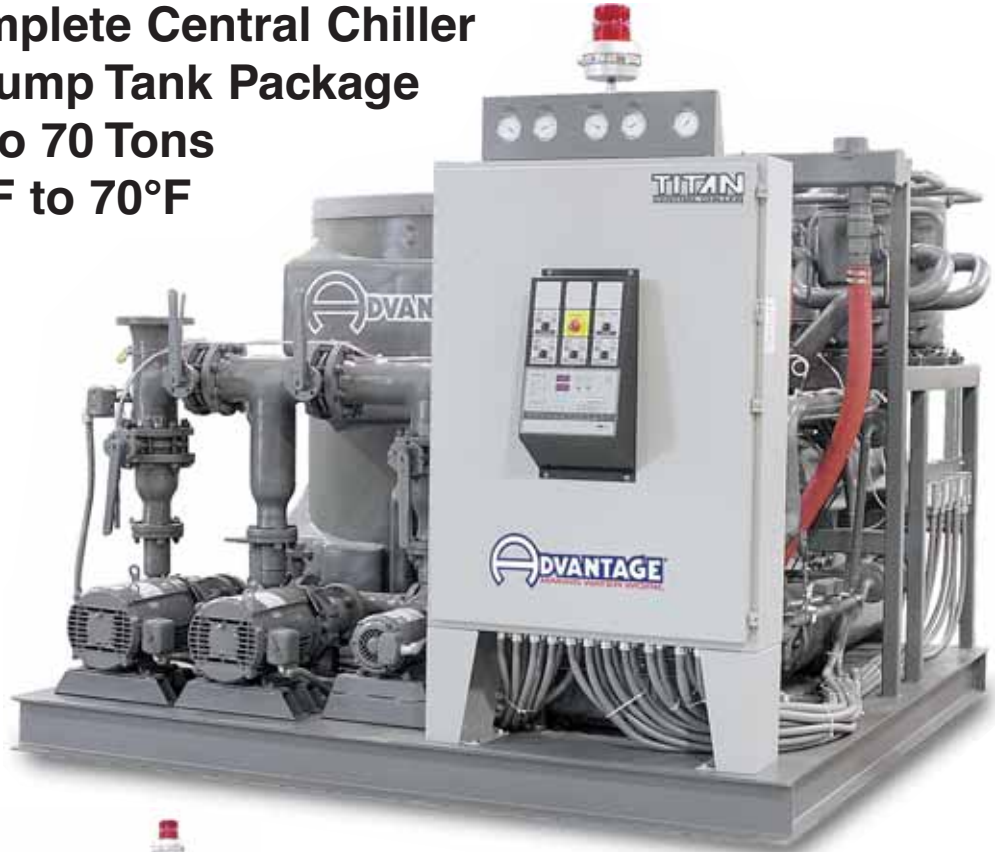
Titan® Series central chiller, model TI-60W shown with optional standby pump and manifold.